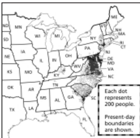
Map A: 1790